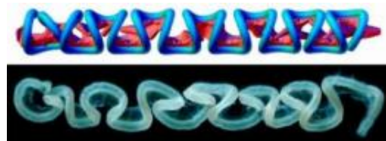
Top: The researchers produced a graphical simulation of gut looping in a chick embryo (stage E16), using a model based on geometry, the mechanical properties of the tissues, and the relative growth rate of the gut tube and the mesentery. Bottom: An actual chick gut (E16).

To express this quantitatively, the researchers built a physical model of the process by sewing a silicone tube to the edge of a stretched sheet of latex-which simulated the gut - mesentery composite-and built mathematical and computational models of the coiling process.