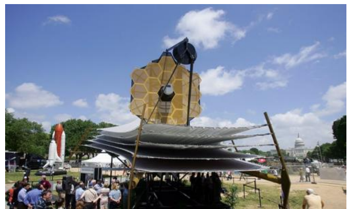
A full scale model of the James Webb Space Telescope sits on the National Mall outside the Smithsonian Air and Space Museum in Washington, DC, in 2007. In a fresh

NASA has repeatedly pushed back the telescope's launch date, now set for 2018 at the earliest.