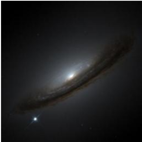
This is Supernovae 1994D. The supernova is the bright point in the lower-left. It is a type Ia thermonuclear supernova like those described by Howell. The supernova is near galaxy NGC 4526, depicted in the center of the image.

"Then, over time, they spiral into each other and merge. When they merge, they blow up. This may be one way to explain what is going on."