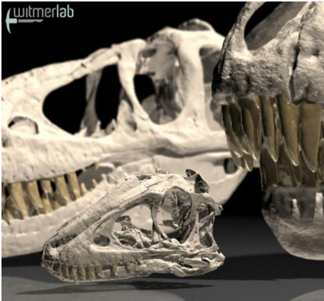
Skull of a 2-year-old juvenile Tarbosaurus, a Cretaceous tyrannosaur from Mongolia, with an adult skull at right and a teenage skull behind for comparison.

While adult tyrannosaurs wielded power and size to kill large prey, youngsters used agility to hunt smaller game.