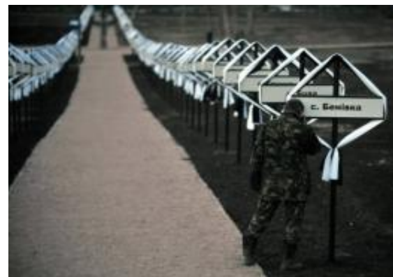
A local resident mourns on April 23, at a cross signed 'Benivka village' as he visits a newly opened alley remembering the villages and cities which perished as a result of Chernobyl's nuclear catastrophe.

Other than 6,000 cases of thyroid cancer -- a usually treatable condition -- from contaminated milk there was "no persuasive evidence" of any other effect on the general population from radiation, it said in a report in February.