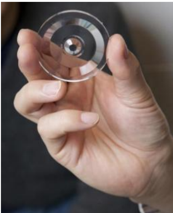
A lens invented at Ohio State University enables

The engineers successfully recorded 3D images of the tip of a ballpoint pen - which has a diameter of about 1 millimeter - and a mini drill bit with a diameter of 0.2 millimeters.