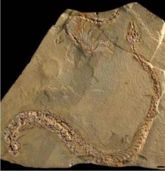
This is a photograph of Eupodophis descouensi , a fossil snake from the Cretaceous Period (95 million years ago) of Lebanon. The black scale bar at the bottom right equals 1 cm. Credit: A. Houssaye

Provided by European Synchrotron Radiation Facility