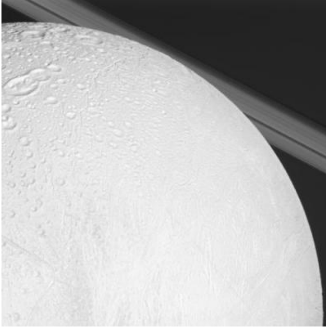
A close look at Enceladus, with Saturn's rings in the background.

The Cassini spacecraft has taken a some recent images of two of Saturn's most notorious moons, where in both images the planet's rings serve as a backdrop. Above, Enceladus stands out with its cratered surface, but Cassini's camera also catches a glimpse of the planet's rings in the background. Geologically young terrain in the middle latitudes of the moon shifts to older, cratered terrain in the northern latitudes.