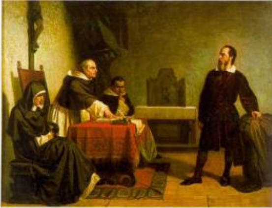
Galileo facing the Roman Inquisition. Painted by Cristiano Banti in 1857.

The Catholic Church and scientists have a history of clashing, but according to Vatican astronomers, some of the stories of Church persecution are distortions of the truth - more gossip than Gospel.