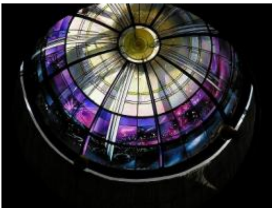
A cosmic stained glass window, in the lobby of the Santa Maria degli Angeli. This church in Rome also features a meridian line and sundial that were added in 1703.