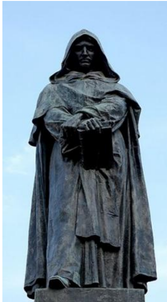
A bronze statue of Giordano Bruno stands in the Campo de' Fiori in Rome, where he was executed in 1600. in 1857

They say there was no religious discussion during this workshop; instead the focus was purely on the science of astrobiology. The philosophical cross-over between religion and science was only discussed informally, during coffee breaks and other social gatherings.