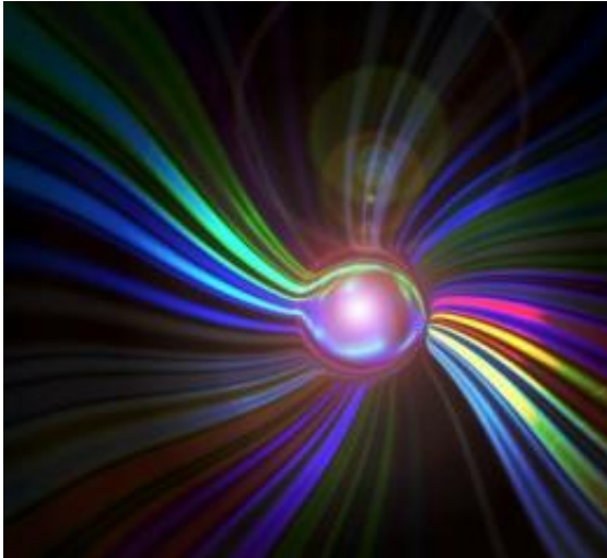
This is an illustration of the "super-photon."

Physicists from the University of Bonn have developed a completely new source of light, a so-called Bose-Einstein condensate consisting of photons. Until recently, experts had thought this impossible. This method may potentially be suitable for designing novel light sources resembling lasers that work in the X-ray range. Among other applications, they might allow building more powerful computer chips. The scientists are reporting on their discovery in the upcoming issue of the journal Nature .