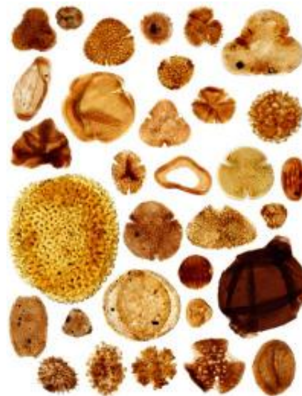
These are transmitted light microscopy photos of several pollen and spore taxa from the Paleocene-Eocene Thermal Maximum.

cores and outcrops from Colombia and Venezuela formed before, during and after an abrupt global warming event called the Paleocene-Eocene Thermal Maximum that occurred 56.3 million years ago. The world warmed by 3-5 degrees C. Carbon dioxide levels doubled in only 10,000 years. Warm conditions lasted for the next 200,000 years.