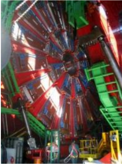
CMS detector for LHC

(PhysOrg.com) -- Proton running for 2010 in the Large Hadron Collider at CERN came to a successful conclusion today. Since the end of March, when the first collisions occurred at a total energy of 7 TeV, the machine and experiment teams have achieved all of their objectives for the first year of proton physics at this record energy and new ground has been explored. For the rest of the year the LHC is moving to a different phase of operation, in which lead ions will be accelerated and brought into collision in the machine for the first time.