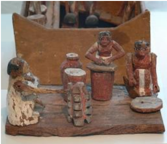
Egyptian 12-dynasty figures shows workers grinding, baking and brewing grain, to make bread and beer.

The first of the modern day tetracyclines was discovered in 1948. It was given the name aureomycin, after the Latin word “aerous,” which means containing gold. “Streptomyces produce a golden colony of bacteria, and if it was floating on a batch of beer, it must have look pretty impressive to ancient people who revered gold,” Nelson theorizes.