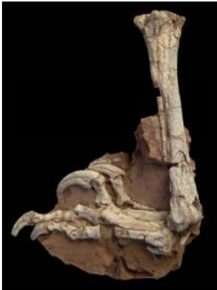
This is the fossilized hindlimb Balaur bondoc showing the double sickle claws of the foot, one of 20 unique features found on a Late Cretaceous island in what is now Europe.

These herbivorous dinosaurs had features not unexpected in island inhabitants: the so-called "island effect" postulates that island dwellers tend to be stranger and smaller than close relatives on continental land masses. Also, animals endemic to islands are often more primitive than their mainland relatives.