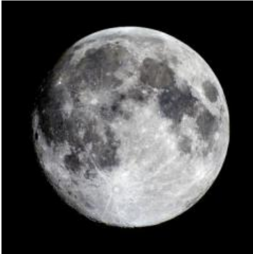
The Moon.

Researchers at the University of Tennessee, Knoxville, are once again turning what scientists thought they knew about the moon on its head.