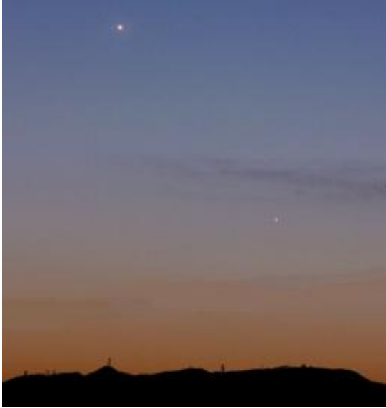
Venus and Mercury converging over Saitama, Japan, on March 30th.

The solar system's innermost planets are about to put on a beautiful show.