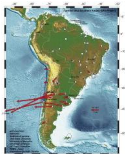
This is a map of South America showing movement of points on continent following Chilean earthquake in February.

The research team deduced the cities' movement by comparing precise GPS ( global positioning satellite ) locations known prior to the major quake to those almost 10 days later. The US Geological Survey reported that there have been dozens of aftershocks, many exceeding magnitude 6.0 or greater, since the initial event February 27.