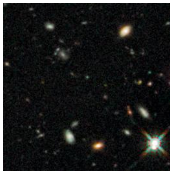
Early Galaxies in HUDF WFC3/IR Closeup.