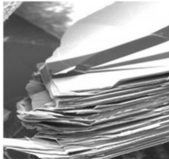
Graphene layers are found in graphite flakes like those from pencil lead.