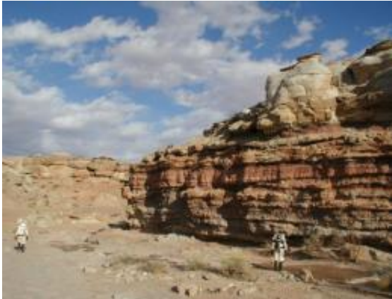
Two 'astronauts' exploring a stream near the MDRS.

(PhysOrg.com) -- Astronauts may in future be wearing spacesuits equipped with artificial intelligence (AI) and digital eyes, turning them into what the researchers call cyborg astrobiologists.