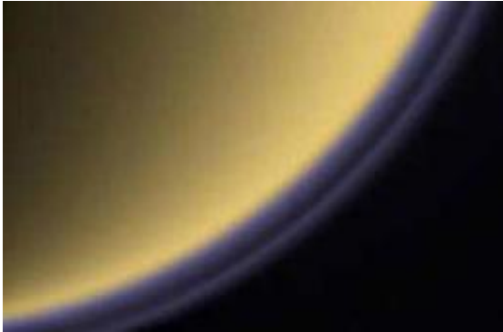
A colorized image of Titan's haze taken during the Cassini mission.

formation to the point where any potential anti-greenhouse effect would be negligible.