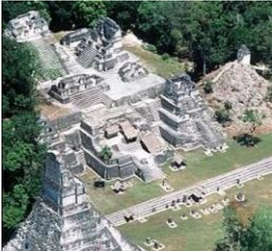
Mayan ruins in Guatemala.

For 1200 years, the Maya dominated Central America. At their peak around 900 A.D., Maya cities teemed with more than 2,000 people per square mile -- comparable to modern Los Angeles County. Even in rural areas the Maya numbered 200 to 400 people per square mile. But suddenly, all was quiet. And the profound silence testified to one of the greatest demographic disasters in human prehistory -- the demise of the once vibrant Maya society.