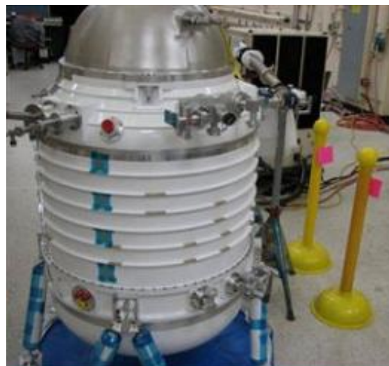
The WISE 2-stage solid hydrogen dewar resembles R2D2 from Star Wars.

"When you look at the sky with new sensitivity and a new wavelength band, like WISE is going to do, you're going to find new things that you didn't know were out there," Wright says.