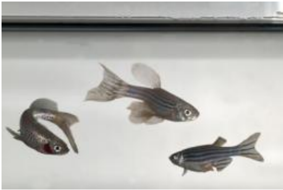
These are zebrafish that were cloned in the Michigan State University Cellular Reprogramming Laboratory.

A team of Michigan State University researchers has developed a new, more efficient way of cloning zebra fish, a breakthrough that could have implications for human health research.