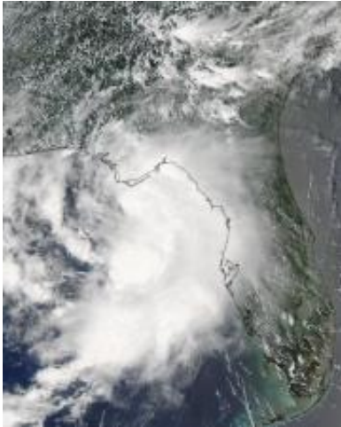
The MODIS instrument on NASA's Aqua satellite captured Claudette's impressive clouds on August 16 at 2:30 p.m. EDT as she was approaching the Florida panhandle.

By mid-day today, Monday, August 17, Claudette's center had moved into southwestern Alabama and weakened into a tropical depression. She'll turn toward the north-northwest later today and soak Alabama with up to 10 inches of rain in some isolated areas.