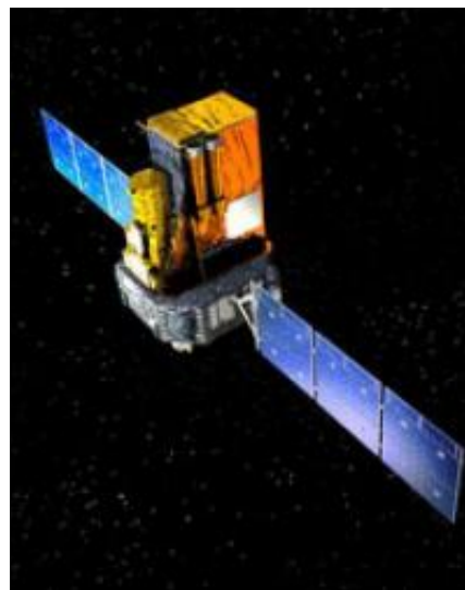
This is the European satellite INTEGRAL.

To explain the source of this mystery, some astronomers had hypothesized the existence of various forms of dark matter, which astronomers suspect exists—from the unusual gravitational effects on visible matter such as stars and galaxies—but have not yet found.