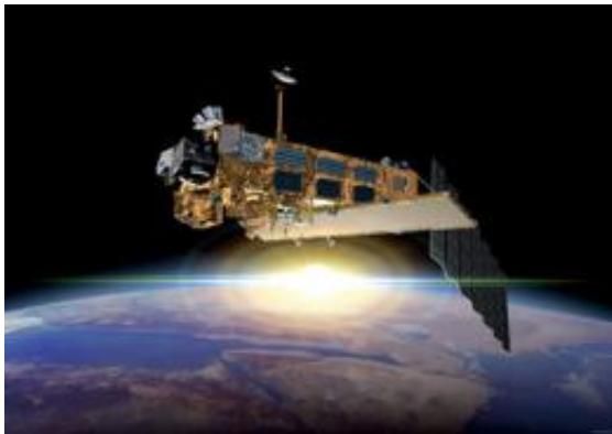
Artist's impression of Envisat.

(PhysOrg.com) -- ESA Member States have unanimously voted to extend the Envisat mission through to 2013. Envisat - the world's largest and most sophisticated satellite ever built - has been providing scientists and operational users with invaluable data for global monitoring and forecasting since its launch in 2002.