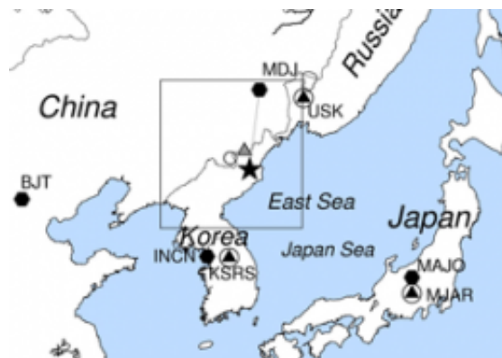
Nuclear test site (star) and surrounding seismic stations (initials). China's Mudanjiang station (MDJ) is 370 kilometers north of the blast.

explosion's size, and many suggest that only eventual leakage of radioactive particles into the air will confirm that the explosion was nuclear, not chemical. The assessment by Richards and Kim is in line with an anonymous Obama administration official who told The New York Times shortly afterward that it was a nuclear blast of "several kilotons" (a kiloton is equal to 1,000 tons of TNT).