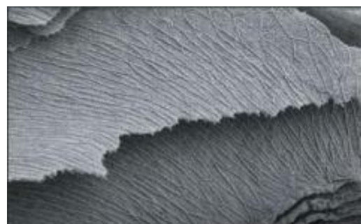
This is the surface of book lung lamella of Rhopalurus laticauda (100 \mu\text{m} ).

This study is the most complete review of scorpion breathing apparatus ever: 200 specimens from 100 genera in 18 scorpion families were examined. This sample represents all major scorpion lineages. Modern microscopy techniques—scanning electron microscopy—allowed Kamenz and Prendini to see detail measured in microns (or one millionth of a meter) that was impossible to observe 100 years ago.