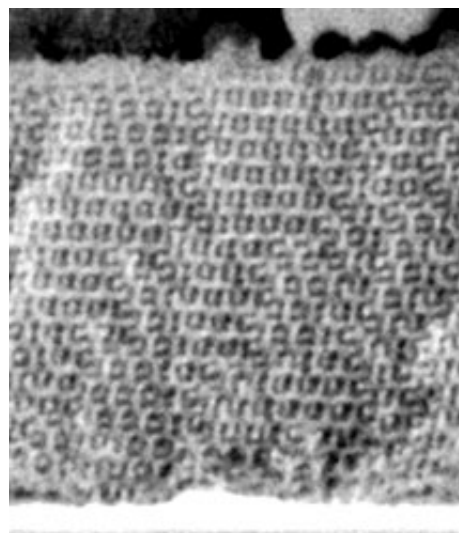
Scanning electron microscope photo of a thin film solar cell shows how the self-assembled gyroid structure interconnects in all directions, forming an easy path for current to flow out.

The idea could lead to more economical solar collectors and more efficient fuel cells.