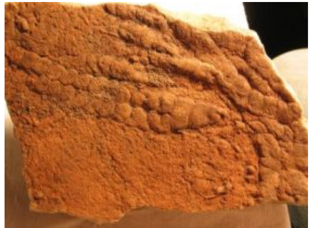
Funisia dorothea seen branching in a fossil excavated in South Australia.

strategies of Funisia dorothea , a tubular organism preserved as a fossil, the researchers found that the organism had multiple means of growing and propagating – similar to strategies used by most invertebrate organisms for propagation today.