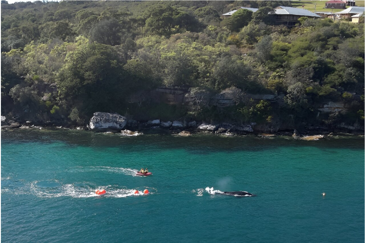
A wildlife rescue team chases an entangled whale swimming in Sydney Harbour.