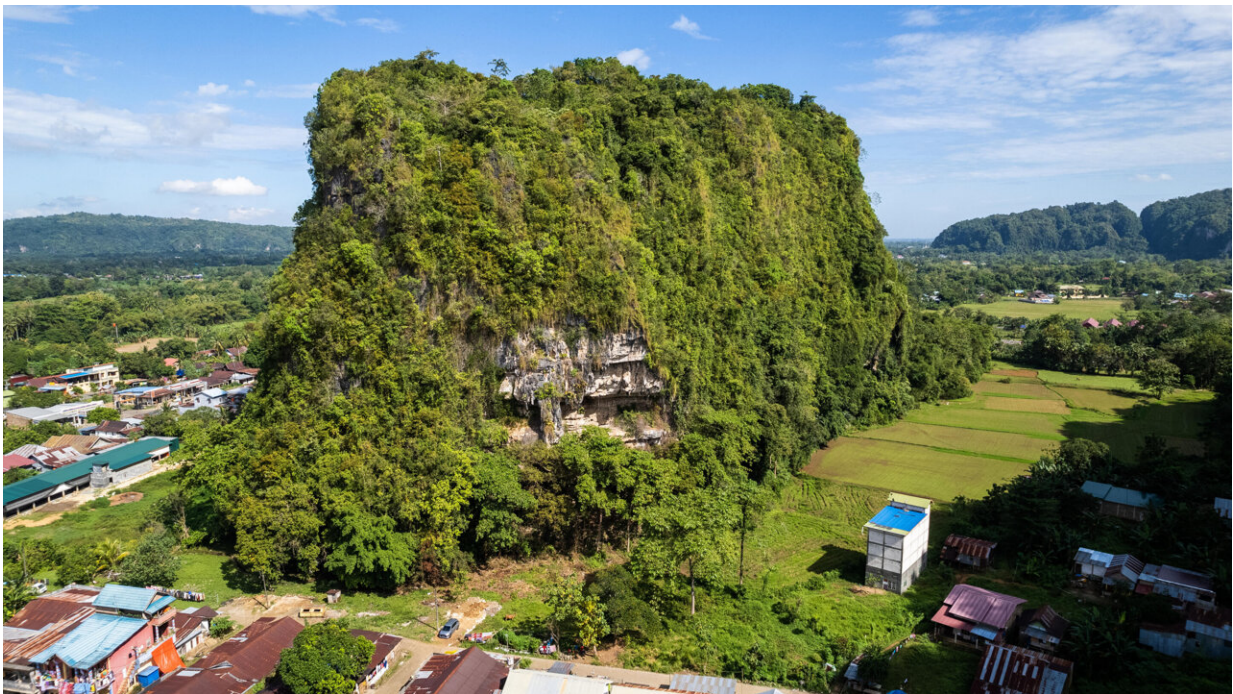
Aerial Photo Karampuang Hill.

It was found to be at least 51,200 years old, smashing the previous record.