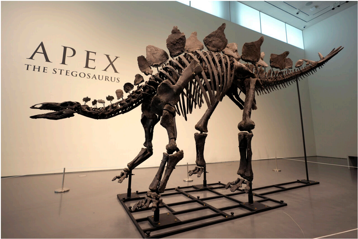
A stegosaurus skeleton is displayed at Sotheby's New York in New York, Wednesday, July 10, 2024.