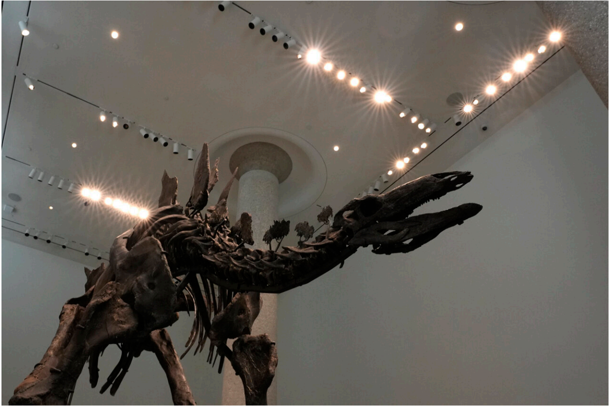
Part of a stegosaurus skeleton is displayed at Sotheby's New York in New York, Wednesday, July 10, 2024.