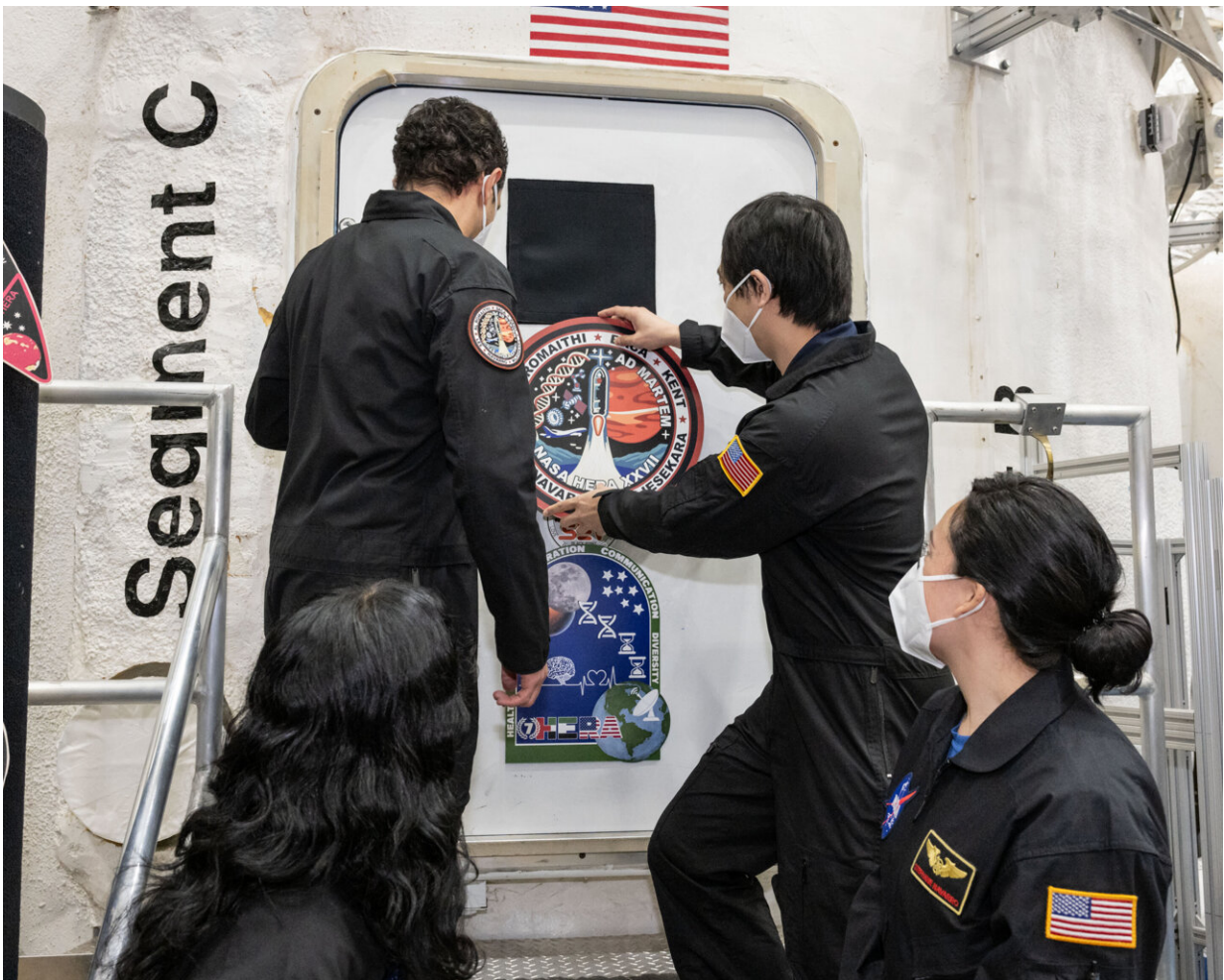
The HERA Campaign 7 Mission 2 crew members place their mission patch on the habitat's airlock door after egress.