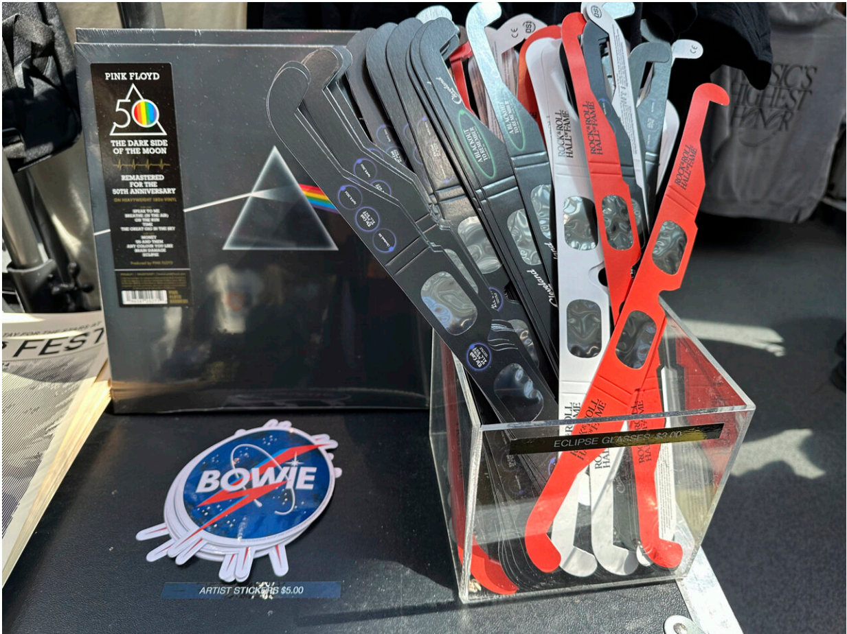
Eclipse glasses are for sale along with Pink Floyd's "Dark Side of the Moon," album at the Rock & Roll Hall of Fame in Cleveland, Sunday, April 7, 2024.