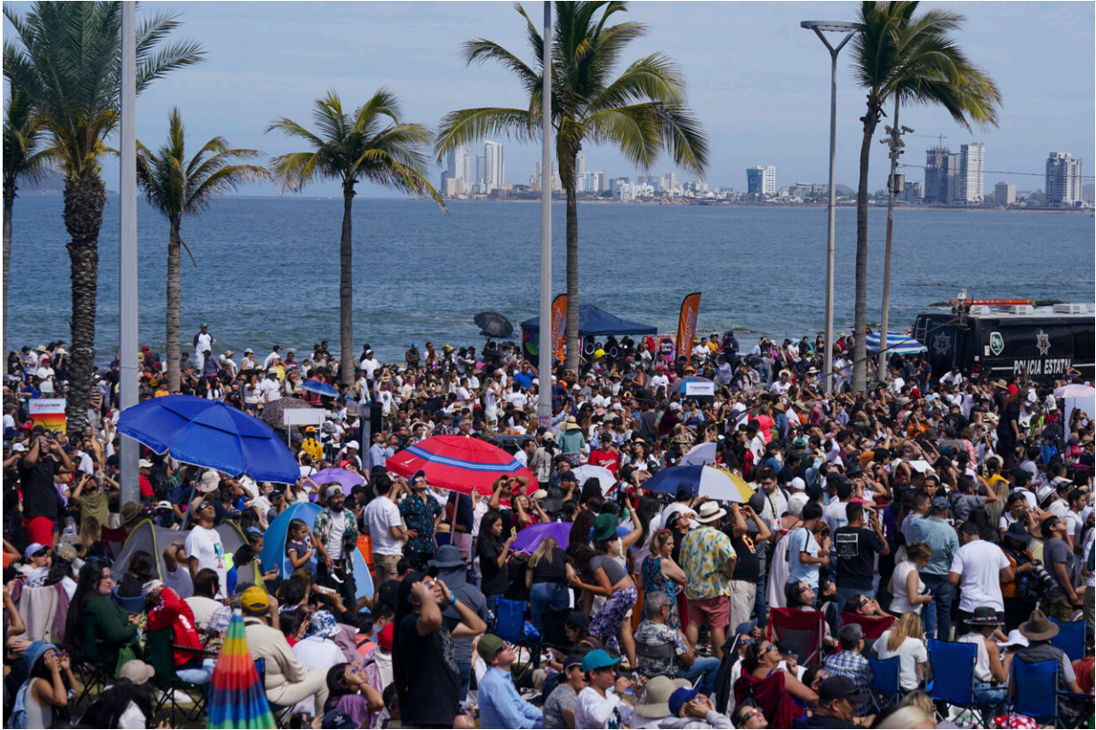
People watch a total solar eclipse in Mazatlan, Mexico, Monday, April 8, 2024.