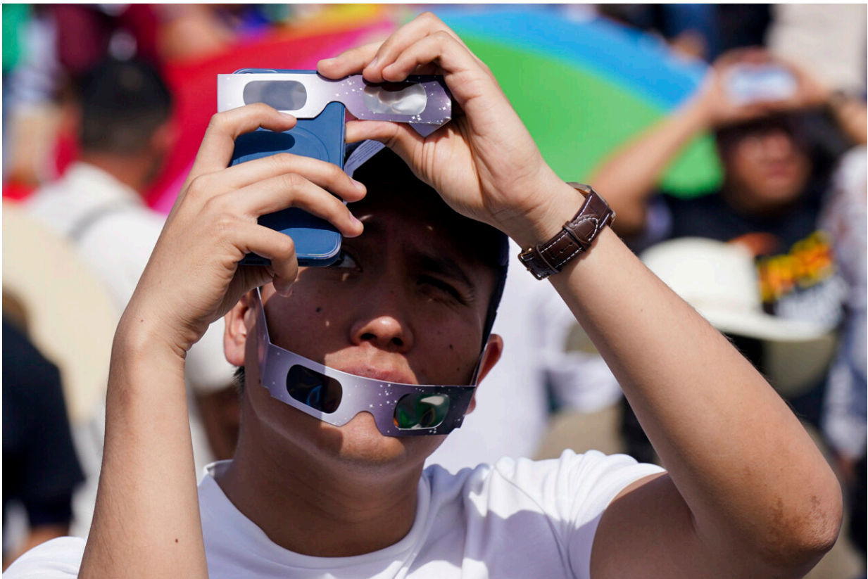
A man takes photos of a total solar eclipse in Mazatlan, Mexico, Monday, April 8, 2024.