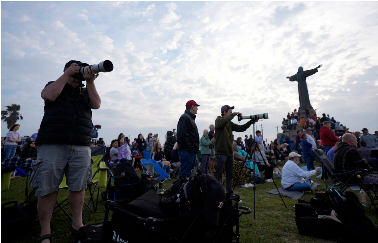
People gather to watch SpaceX's mega rocket Starship launch its third test flight from Starbase in Boca Chica, Texas, Thursday, March 14, 2024.

SpaceX's Elon Musk had just congratulated his team a little earlier. "SpaceX has come a long way," he said via X, formerly called Twitter. The rocket company was founded exactly 22 years ago Thursday.