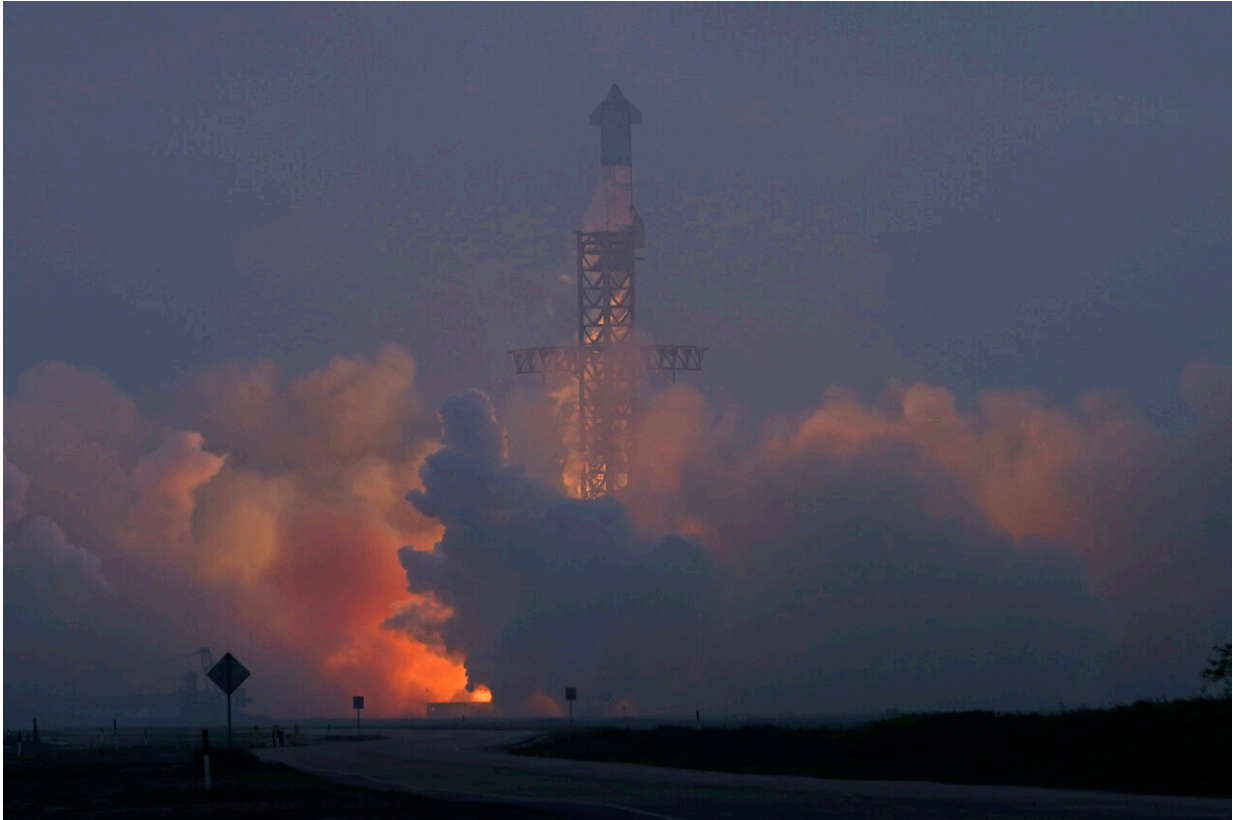
SpaceX's mega rocket Starship launches at dawn in the haze on it's third test flight from Starbase in Boca Chica, Texas, Thursday, March 14, 2024.