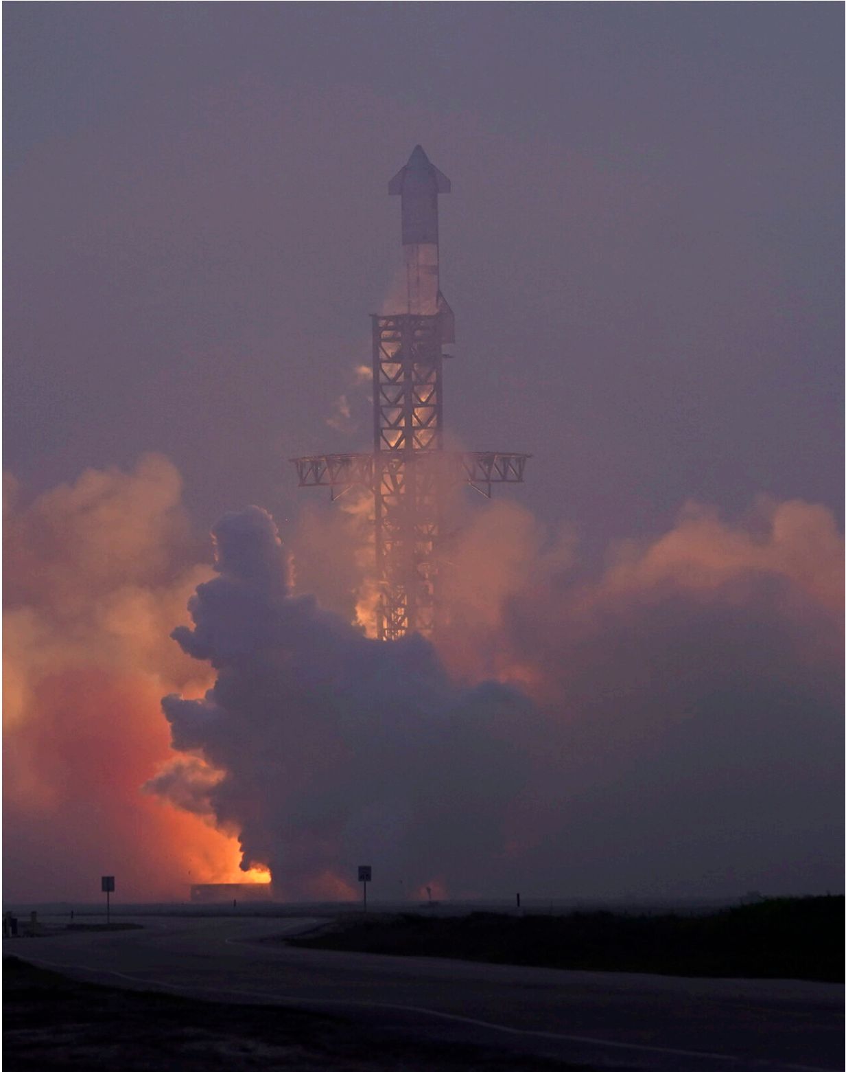
SpaceX's mega rocket Starship launches at dawn in the haze on it's third test flight from Starbase in Boca Chica, Texas, Thursday, March 14, 2024. Credit: