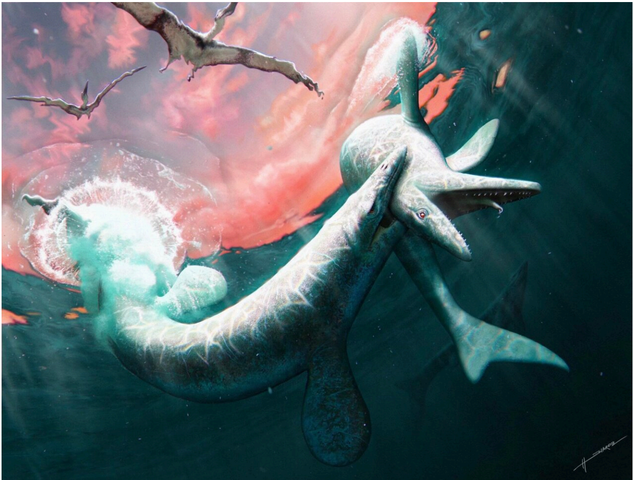
A reconstruction of two Jormungandr walhallaensis mosasaurs fighting.