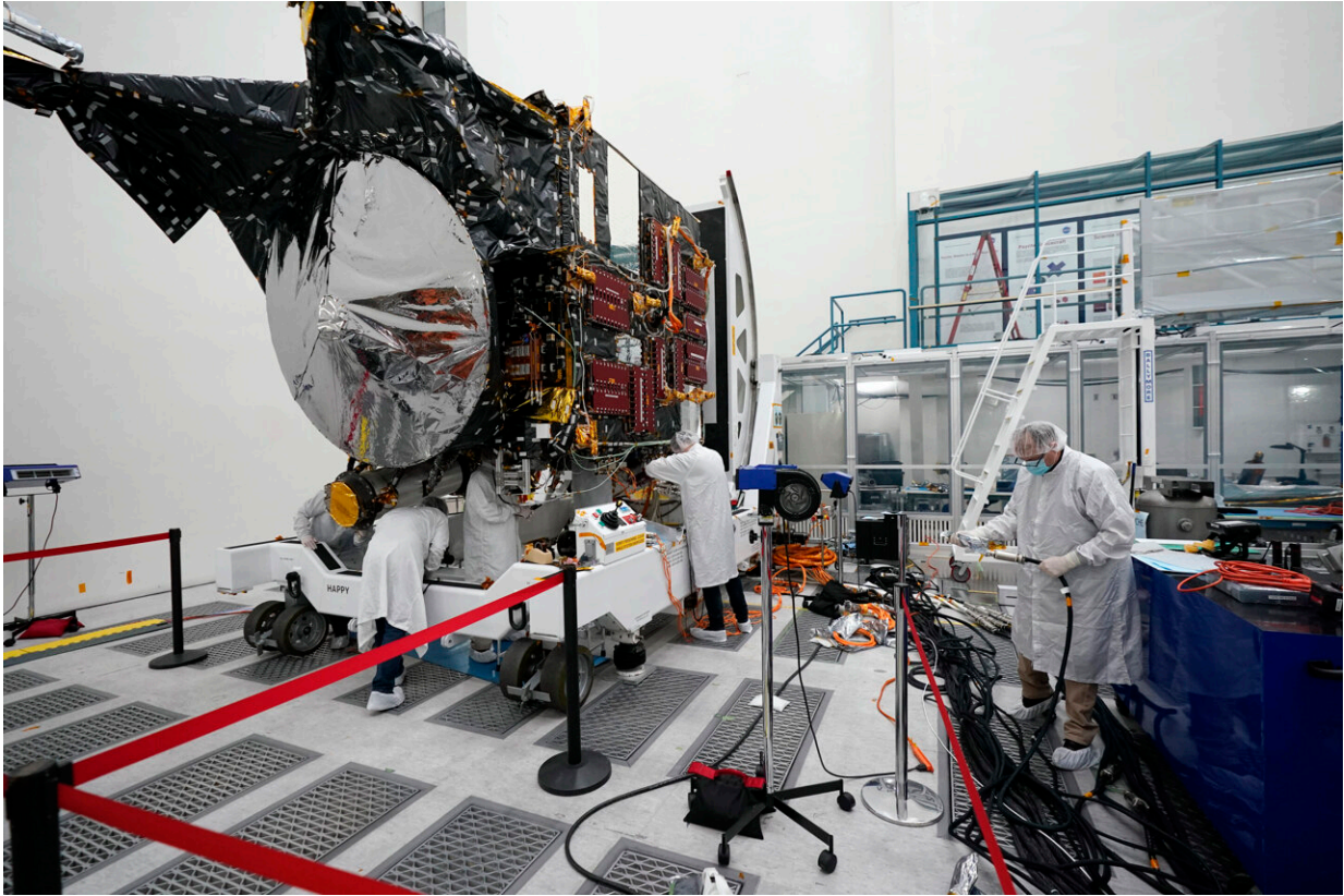
Technicians work on the Psyche spacecraft at the NASA Jet Propulsion Laboratory Monday, April 11, 2022, in Pasadena, Calif. The spacecraft is designed to orbit an asteroid, also named Psyche, to study its properties. A NASA spacecraft has rocketed away on a six-year journey to a rare asteroid made of metal. SpaceX launched the Psyche spacecraft on Friday, Oct. 13, 2023 from the Kennedy Space Center in Florida