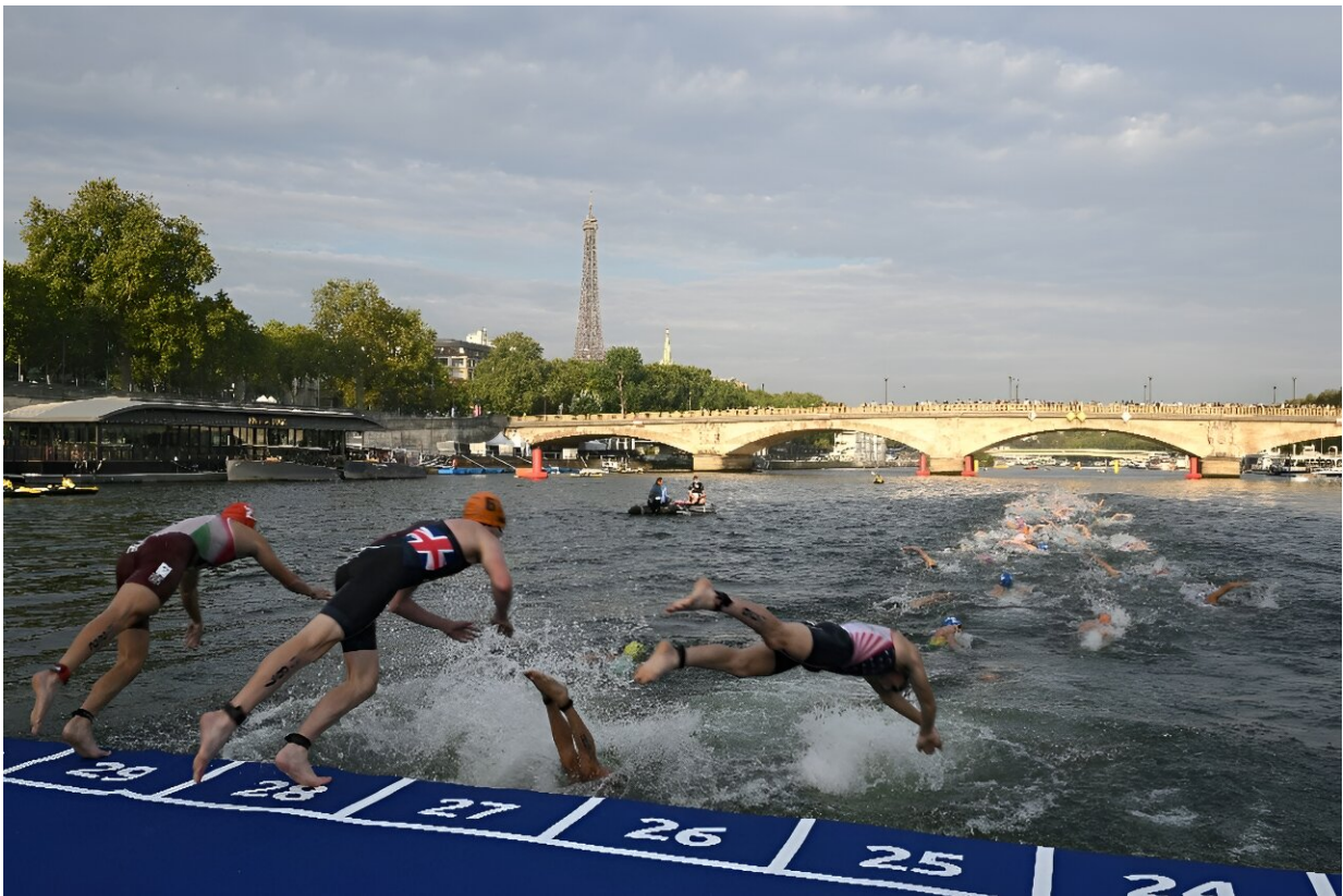
Athletes dive into the Seine River on Friday for the men's 2023 World Triathlon pre-Olympic test event.

"It's extremely encouraging, you have to see the glass half full. I repeat, we will be ready."