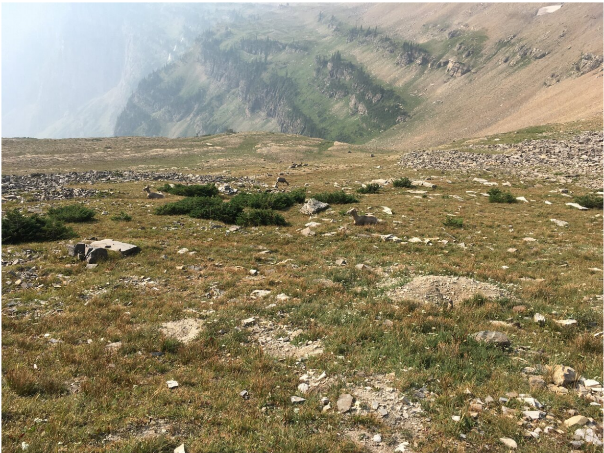
A ewe group in typical summer habitat in Glacier National Park.

Tosa emphasizes the importance of contact analysis in understanding the fitness tradeoffs of sociality and the potential for disease transmission among bighorn sheep populations. The findings provide valuable insights into the delicate balance of social behavior and disease dynamics in challenging environments.