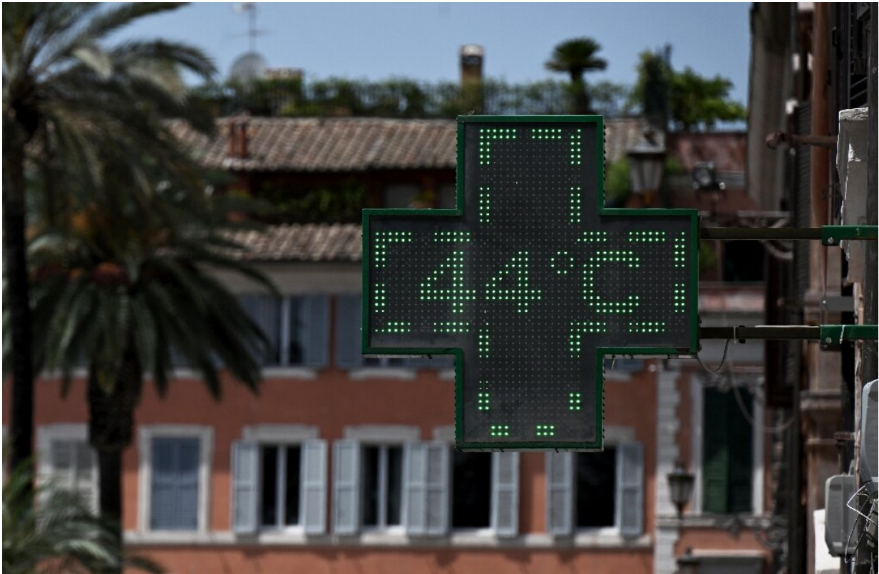
A pharmacy's sign flashes 44C near the Spanish Steps in Rome.

"This underlines the increasing urgency of cutting greenhouse gas emissions as quickly and as deeply as possible."