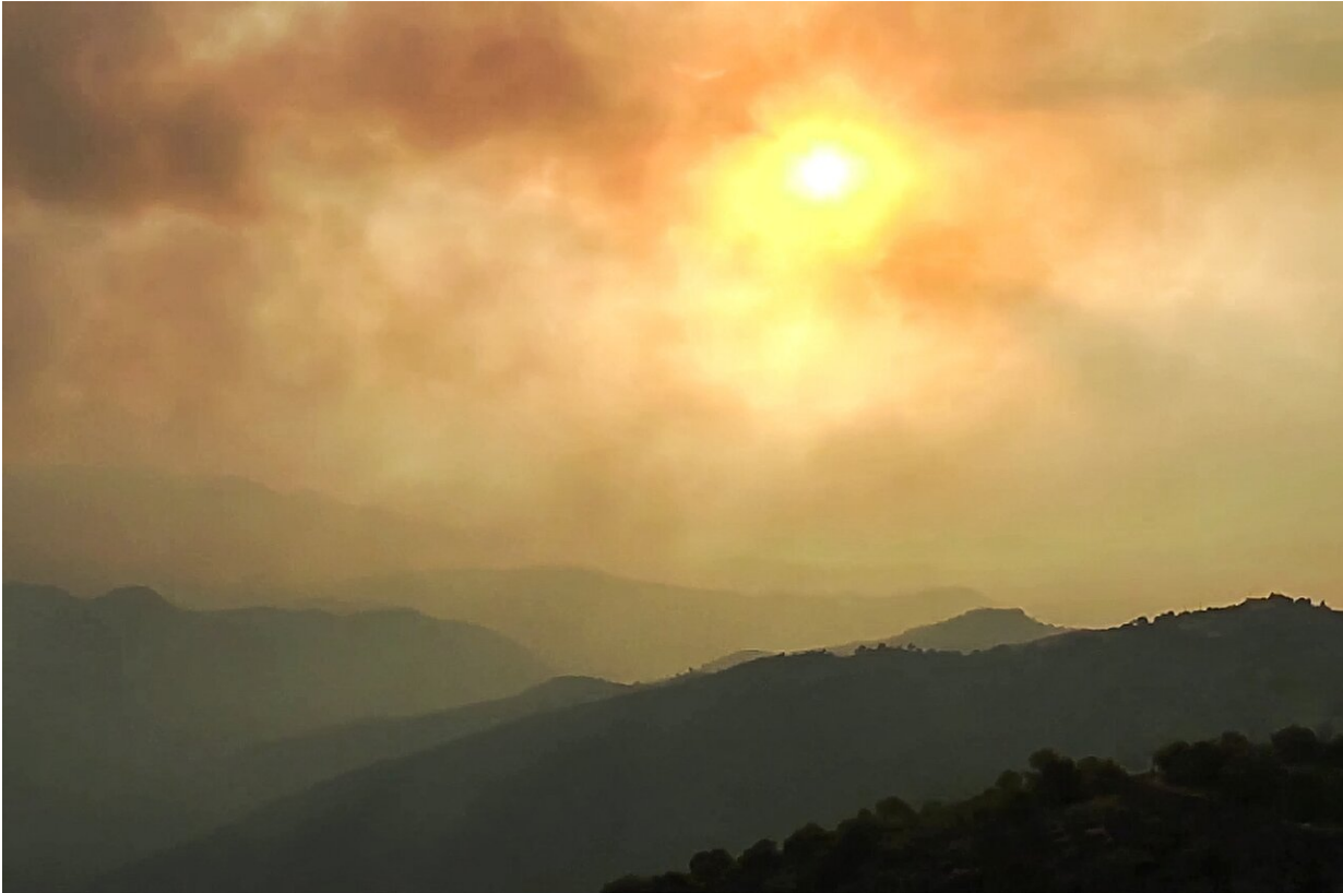
This image grab taken from AFPTV video footage shows smoke clouds covering the sky during wildfires in the forests of Bejaia in northern Algeria on July 25, 2023.