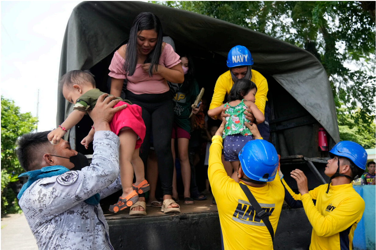
Philippine Navy personnel help bring down children from a military truck as they arrive at an evacuation center in Santo Domingo town, Albay province, northeastern Philippines, Tuesday, June 13, 2023. Truckloads of villagers on Tuesday fled from Philippine communities close to gently erupting Mayon volcano, traumatized by the sight of red-hot lava flowing down its crater and sporadic blasts of ash.