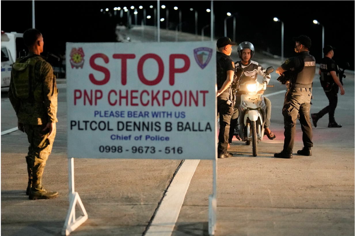
Police stop a motorcycle rider at a checkpoint at the border of the "permanent danger zone" around Mayon volcano at Daraga town, Albay province, northeastern Philippines, Tuesday, June 13, 2023. Truckloads of villagers on Tuesday fled from Philippine communities close to gently erupting Mayon volcano, traumatized by the sight of red-hot lava flowing down its crater and sporadic blasts of ash.