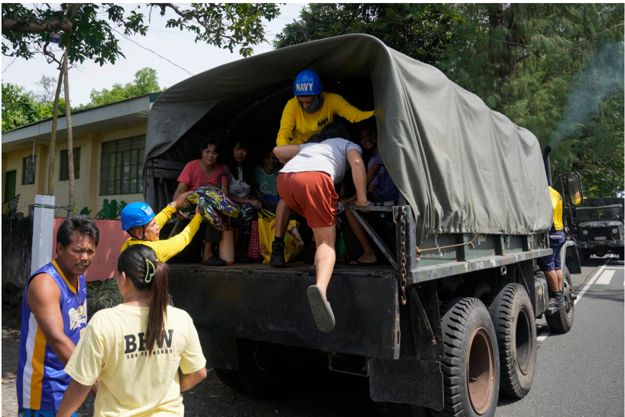
Villagers ride a military truck as they evacuate their homes in Santo Domingo town, Albay province, northeastern Philippines, Tuesday, June 13, 2023.

The 2,462-meter (8,077-foot) Mayon is a top tourist draw in the Philippines because of its picturesque conical shape but is the most active of 24 known volcanoes in the archipelago. It last erupted violently in 2018, displacing tens of thousands. In 1814, Mayon's eruption buried entire villages and left more than 1,000 people dead.