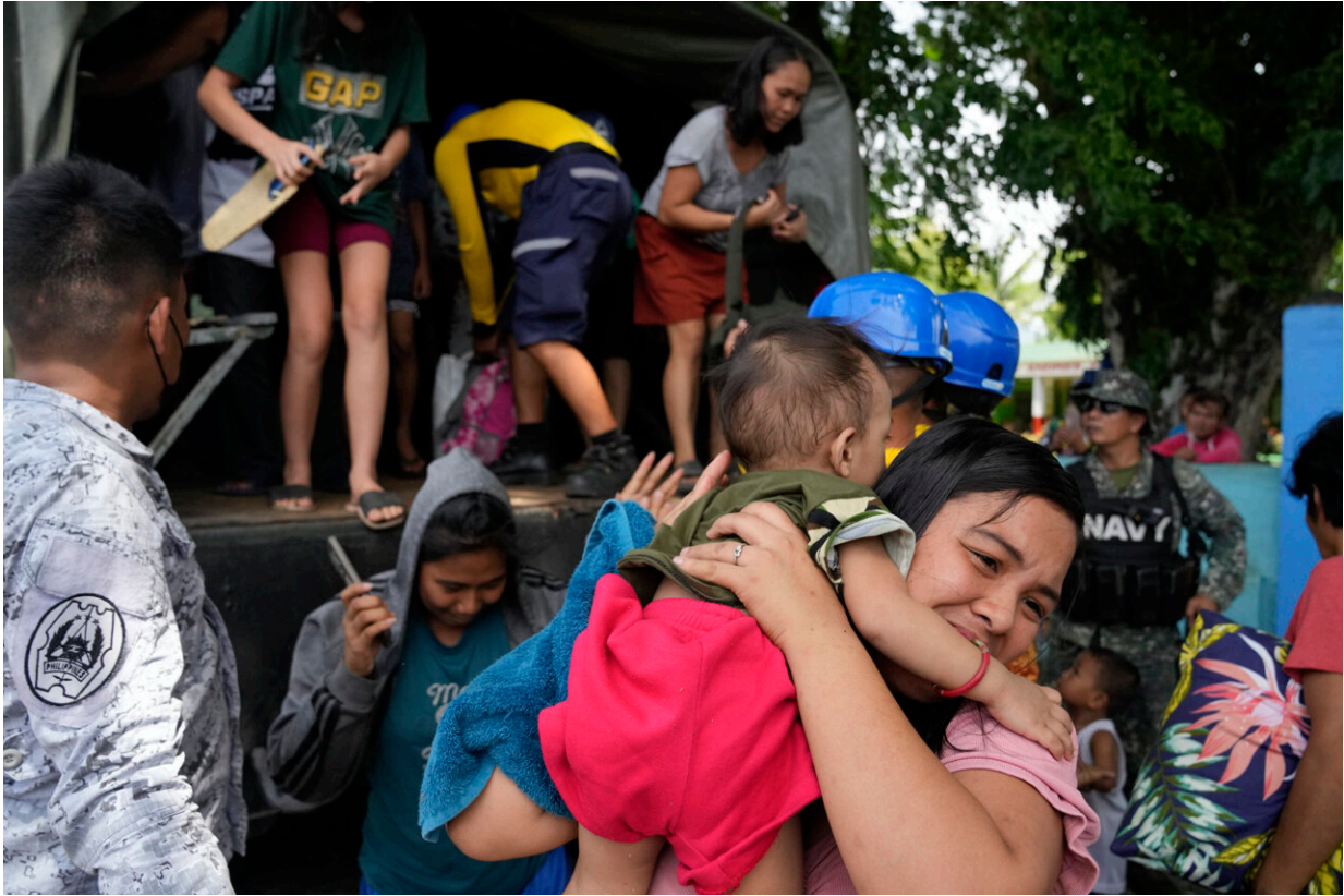
Residents arrive on a military truck at an evacuation center in Santo Domingo town, Albay province, northeastern Philippines, Tuesday, June 13, 2023. Truckloads of villagers on Tuesday fled from Philippine communities close to gently erupting Mayon volcano, traumatized by the sight of red-hot lava flowing down its crater and sporadic blasts of ash.