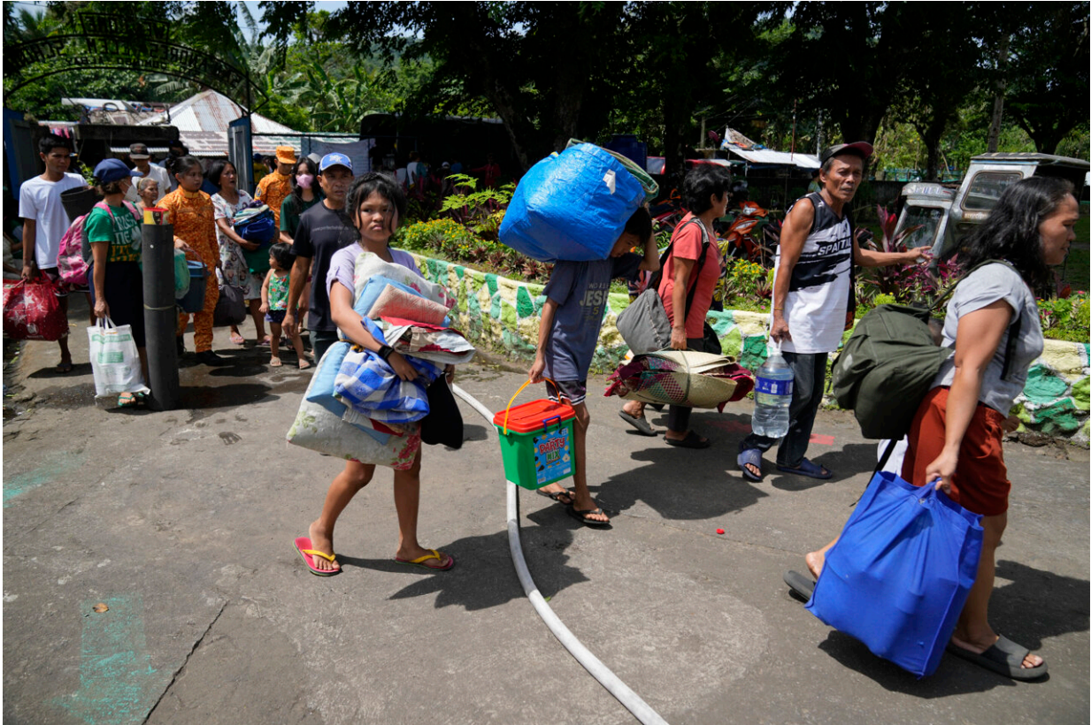
Residents arrive at an evacuation center in Santo Domingo town, Albay province, northeastern Philippines, Tuesday, June 13, 2023. Truckloads of villagers on Tuesday fled from Philippine communities close to gently erupting Mayon volcano, traumatized by the sight of red-hot lava flowing down its crater and sporadic blasts of ash.