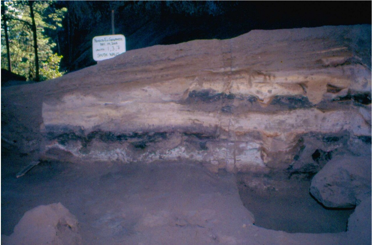
Archaeological excavation of El Gigante rockshelter.