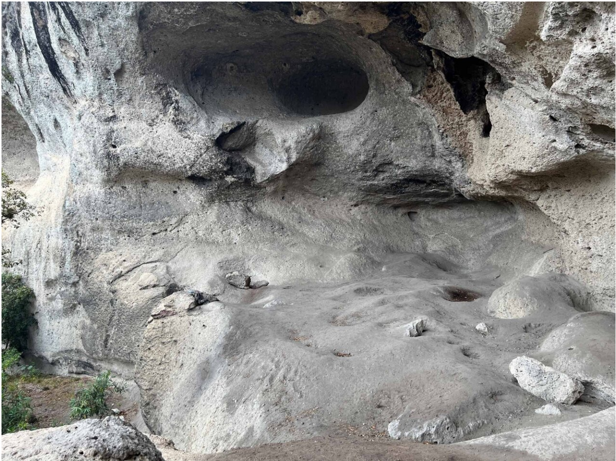
The El Gigante rockshelter in western Honduras.

The study provides a major update to the chronology of tree and field crop use evident in the El Gigante with 375 radiocarbon dates , finding that tree fruits and squash appeared early, around 11,000 years ago, with most other field crops appearing later in time—maize around 4,500 years, beans around 2,200 years ago. The initial focus on tree fruits and squash, Kennett noted, is consistent with early coevolutionary partnering with humans as seed dispersers in the wake of megafaunal extinction in Central America.