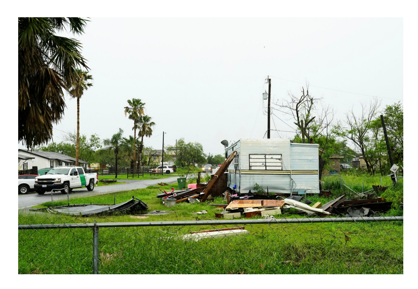
A U.S. Customs and Border Protection vehicle drives past a home damaged by a tornado Saturday, May 13, 2023, in Laguna Heights, Texas. At least one person was killed when a tornado struck an unincorporated community on the Gulf coast near the southern tip of Texas, damaging dozens of homes and knocking down power lines early Saturday, authorities said.