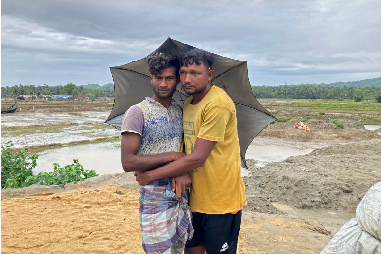
Fisherman stand under an umbrella and watch their boats at the coast in Cox's Bazar district, Bangladesh, Sunday, May 14, 2023. Bangladesh and Myanmar are bracing as an extremely severe cyclone starts to hit their coastal areas, and authorities urged thousands of people in both countries to seek shelter.