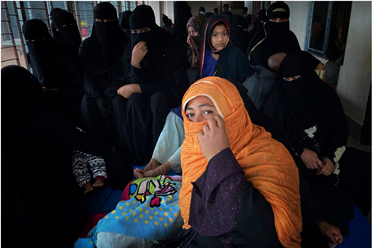
Women sit inside a room at a makeshift shelter set up for residents of coastal areas, in Teknaf, near Cox's Bazar, Bangladesh, Sunday, May 14, 2023. Bangladesh and Myanmar braced Sunday as a severe cyclone started to hit coastal areas and authorities urged thousands of people in both countries to seek shelter.