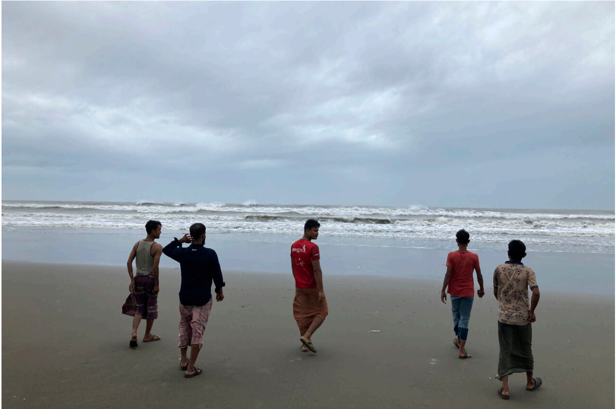
Fisherman walk at the coast in Cox's Bazar district, Bangladesh, Sunday, May 14, 2023. Bangladesh and Myanmar are bracing as an extremely severe cyclone starts to hit their coastal areas, and authorities urged thousands of people in both countries to seek shelter.