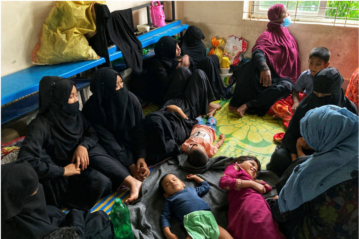
Women spend time with their children at a makeshift shelter set up for residents of coastal areas, in Teknaf, near Cox's Bazar, Bangladesh, Sunday, May 14, 2023. Bangladesh and Myanmar braced Sunday as a severe cyclone started to hit coastal areas and authorities urged thousands of people in both countries to seek shelter.