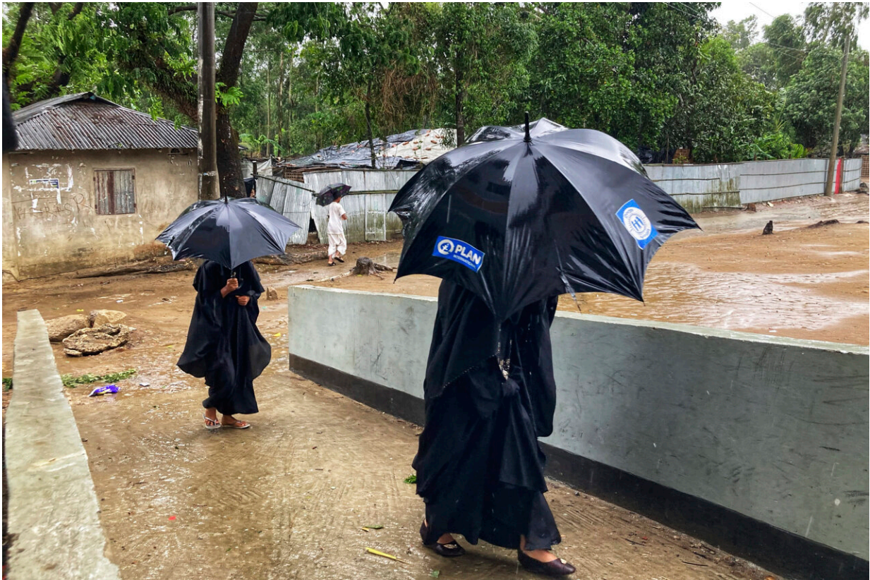
Women arrive at a makeshift shelter set up for residents of coastal areas, in Teknaf, near Cox's Bazar, Bangladesh, Sunday, May 14, 2023. Bangladesh and Myanmar braced Sunday as a severe cyclone started to hit coastal areas and authorities urged thousands of people in both countries to seek shelter.