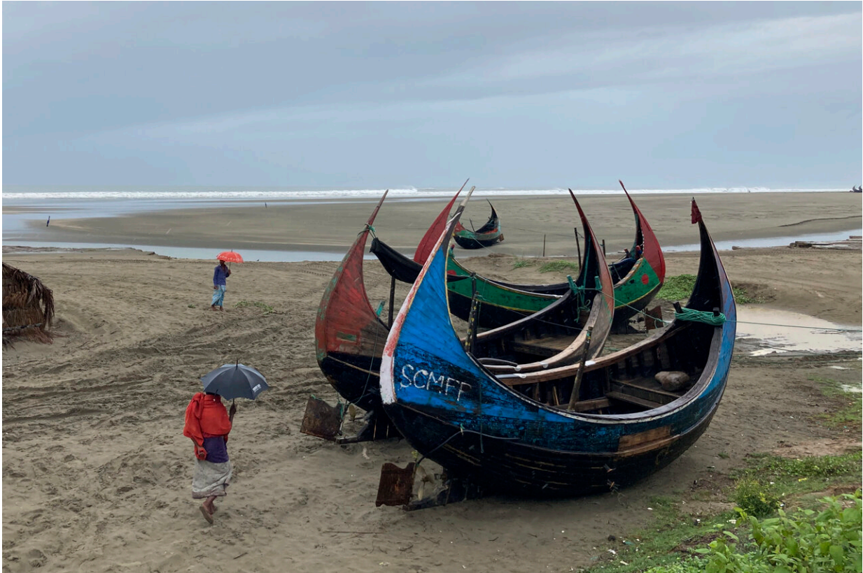
Fisherman walk near the boats anchored at the coast in Cox's Bazar district, Bangladesh, Sunday, May 14, 2023. Bangladesh and Myanmar are bracing as an extremely severe cyclone starts to hit their coastal areas, and authorities urged thousands of people in both countries to seek shelter.