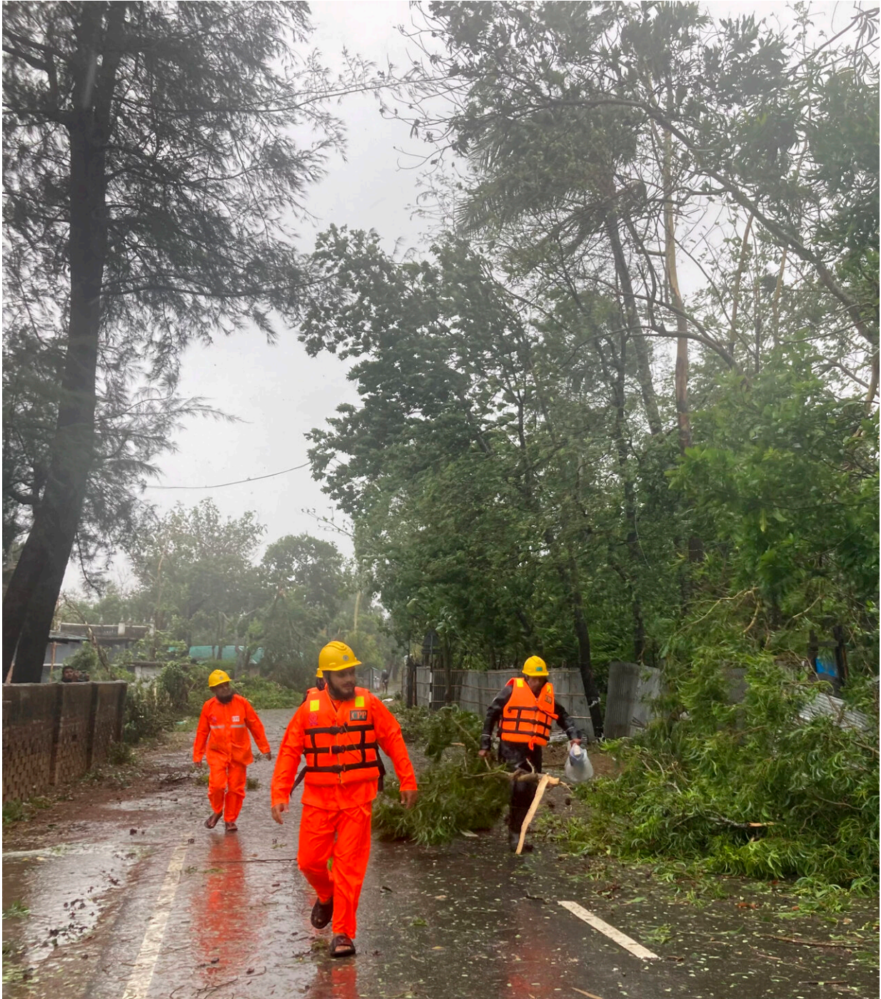
Rescue workers remove the fallen tress after a storm in Teknaf, near Cox's Bazar, Bangladesh, Sunday, May 14, 2023. Bangladesh and Myanmar braced Sunday as a severe cyclone started to hit coastal areas and authorities urged thousands of people in both countries to seek shelter.