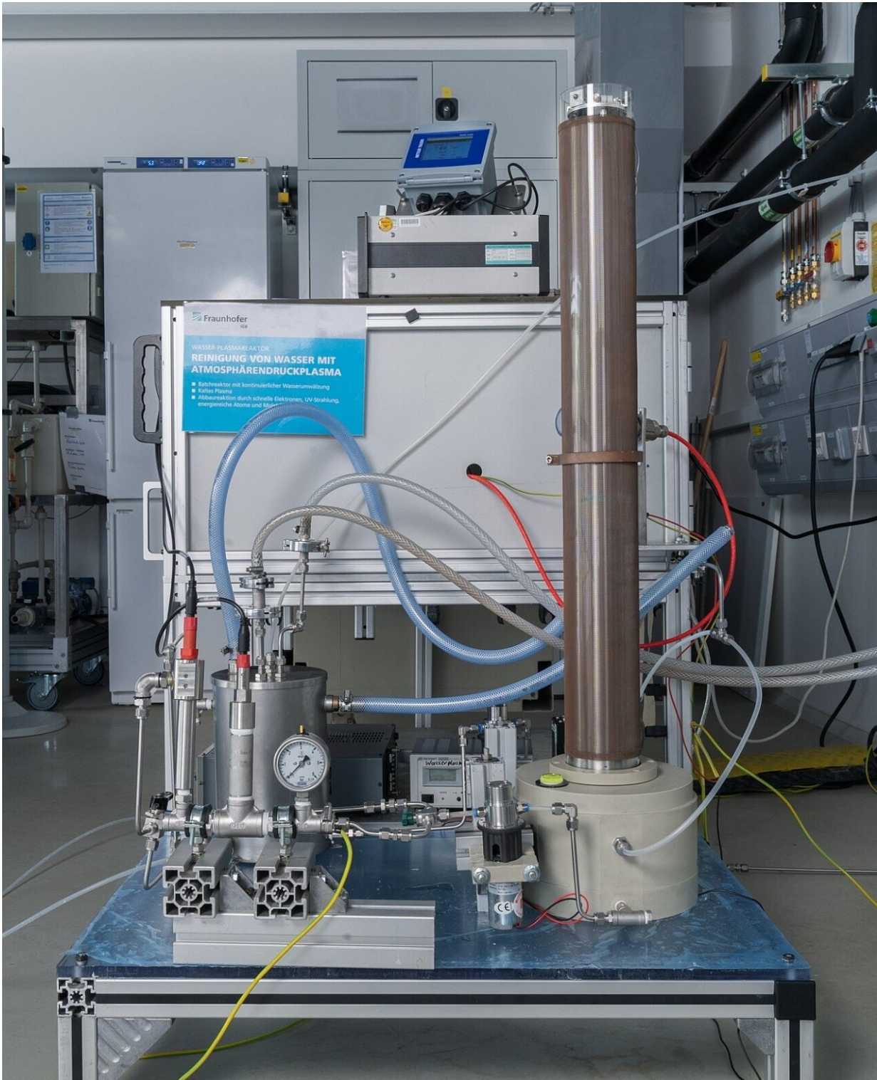
Pilot plant for the elimination of PFAS. Following the initial success of the trials, the technology is now to be optimized and scaled up for practical applications on an industrial scale.