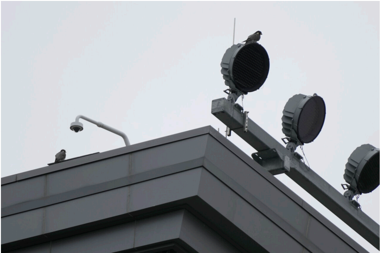
A pair of peregrine falcons are seen on the roof of Spartan Stadium, Wednesday, May 24, 2023, in East Lansing, Mich. A state wildlife biologist banded four peregrine falcon chicks that live in a nest situated on the top of Spartan Stadium, home of Michigan State University's football team.